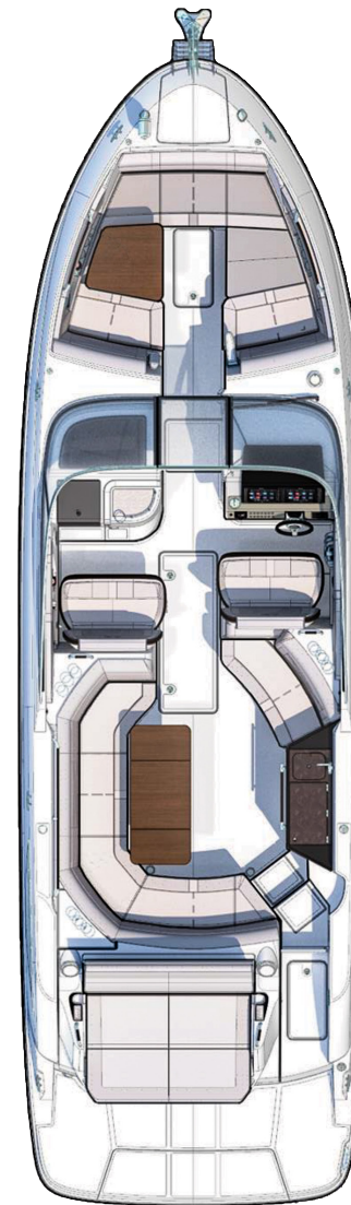
Accommodations Plan (Shown with optional equipment)

International Trailer - Aluminum w/ Bunks or Rollers