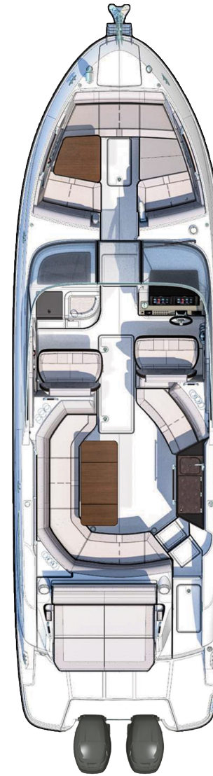
Accommodations Plan (Shown with optional equipment)

International Trailer - Aluminum w/ Bunks or Rollers