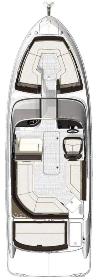
STANDARD SEATING PLAN