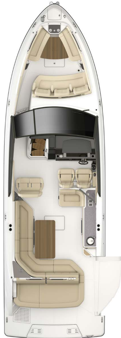
BOW & COCKPIT