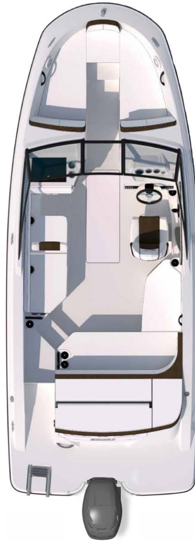
OPTIONAL PORT LOUNGER with convertible backrest