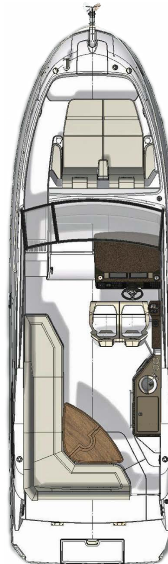
DECK / COCKPIT