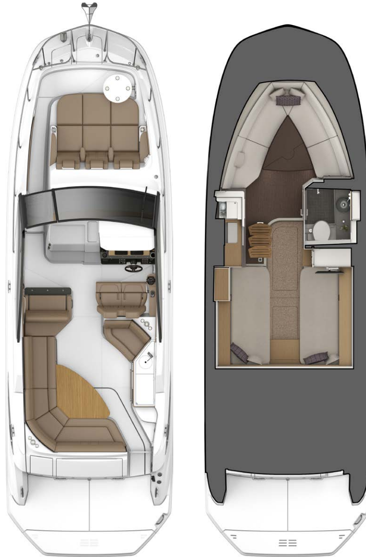
DECK / COCKPIT